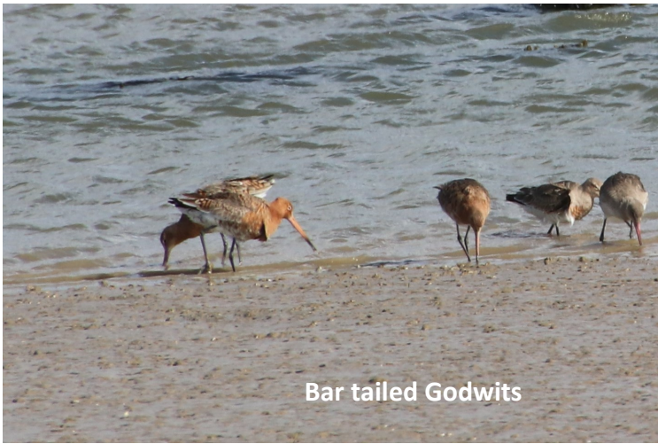
Bar tailed Godwits