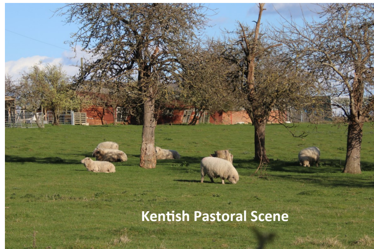
Kentish Pastoral Scene