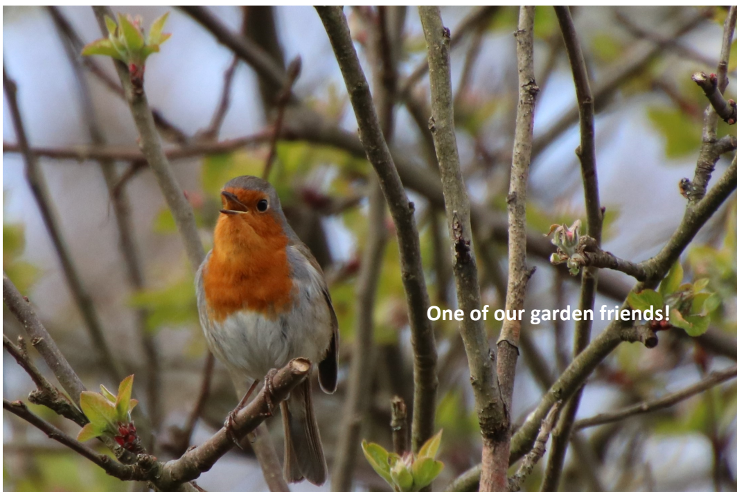
One of our garden friends!