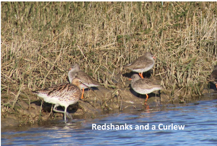
Redshanks and a Curlew